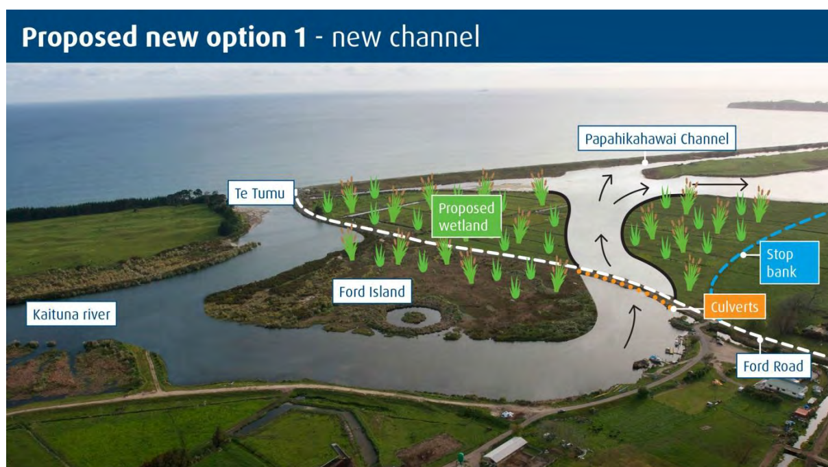
Figure 4 Option 1: New channel at Te Tumu showing the location of channels, proposed wetlands and stopbanks.

Option 1 is predicted to re-divert 487,000 m 3 per tidal cycle which is about 17% of the total river volume. This volume is equivalent to 34% of the mean tidal volume of Ongatoro/Maketū Estuary. The freshwater fraction of the re-diverted flow is predicted to be 269,000 m 3 per tidal cycle, or 55%. Option 1 will direct re-diverted flows around both sides of Papahikahawai Island as was the case prior to 1956, and is shown in Figure 4.