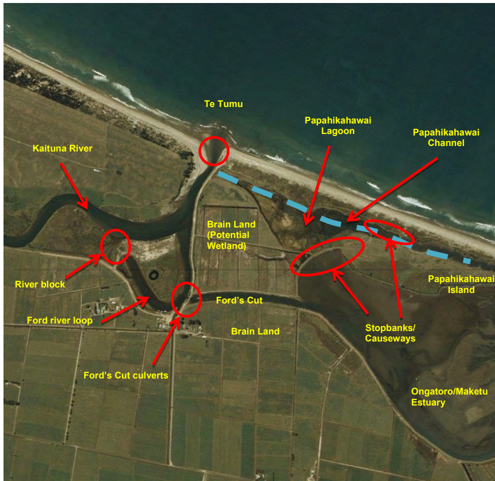
Figure 1 Key features.

The key features of the area are shown in Figure 1.