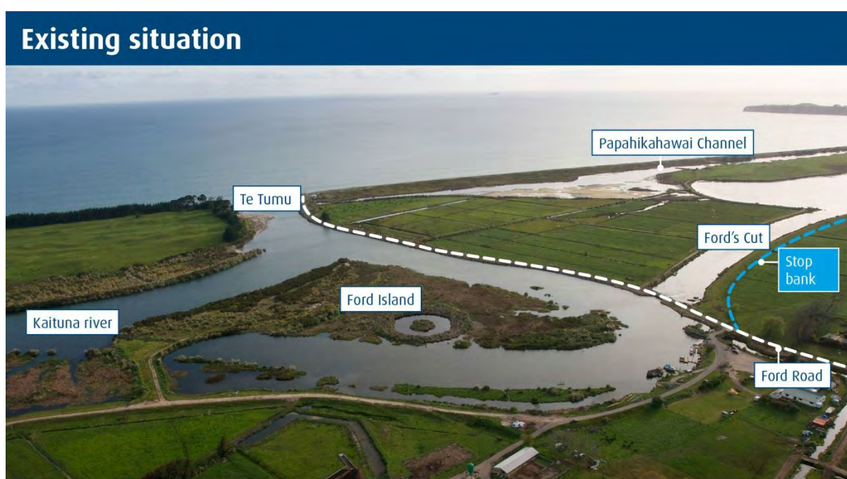
Figure 3 Existing situation at Te Tumu showing the location of channels and stopbanks.

The Department of Conservation holds the existing resource consent for the re-diversion through Ford's Cut, and is in the process of applying for a five year renewal of this through to 2018.