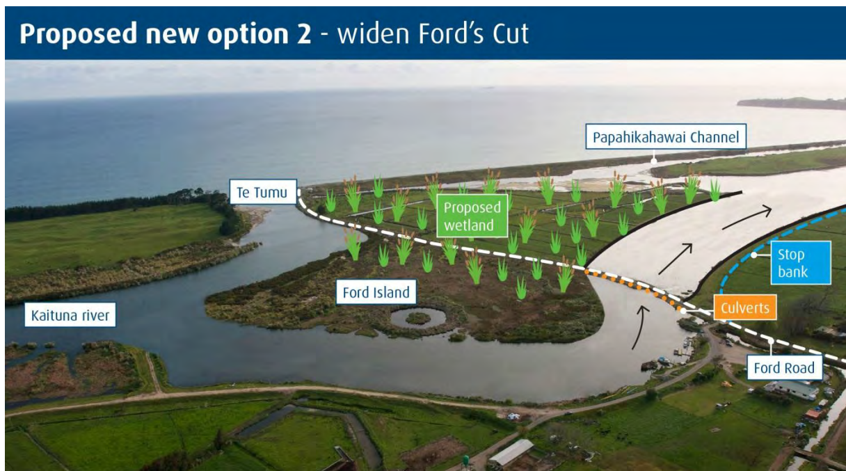
Figure 5 Option 2: Widen Ford's Cut at Te Tumu showing the location of channels, proposed wetlands and stopbanks.

Option 2 is predicted to re-divert 487,000 m 3 per tidal cycle which is about 17% of the total river volume (the same as Option 1). This volume is equivalent to 34% of the mean tidal volume of Ongatoro/Maketū Estuary. The freshwater fraction of the re-diverted flow is predicted to be 269,000 m 3 per tidal cycle, or 55%. This option will direct re-diverted flows into the southern part of Ongatoro/Maketū estuary, but there will still be some flows around the northern side of Papahikahawai Island. Option 2 is shown in Figure 5.